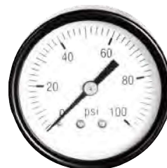
1/4" MNPT Pressure Gauge Included